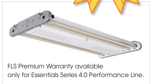
FLS Premium Warranty available only for Essentials Series 4.0 Performance Line.